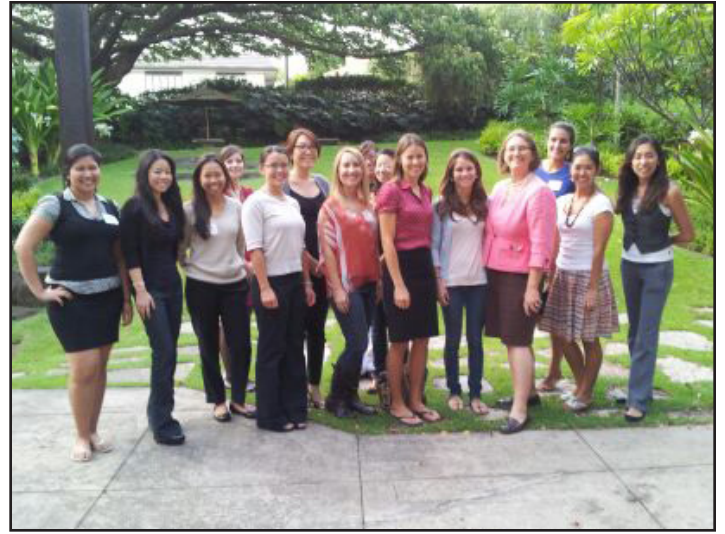
Alumni of the $tart $mart workshop held September 28, 2012 at the UH Shidler College of Business